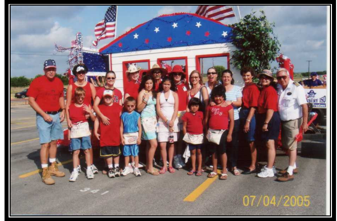
Habitat Children and their 4th of July float. (see article on next page.)

Habitat for Humanity of Hood County P.O. Box 1866 Granbury, TX 76048